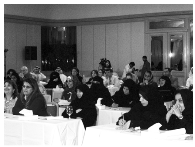
Figure 5. Audience right.