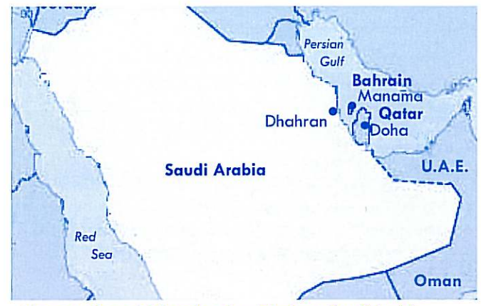
Figure 1. Map of delegation sites: Dhahran, Saudi Arabia; Doha, Qatar; and Manama, Bahrain.

From October 15th to the 24th, an ABA delegation traveled to the Middle East to promote the long-term establishment of behavior analysis in the region. Members of the delegation traveled to Manama, Bahrain; Dhahran, Saudi Arabia; and Doha, Qatar. The delegation's major activities took place in Bahrain's capital and largest city, Manama. Bahrain, officially the Kingdom of Bahrain (Mamlakah al-Bahrain in Arabic), is an independent country made up of 33 islands in the western Persian Gulf. Dhahran is the headquarters of Saudi Aramco, the largest oil company in the world. Doha, the capital and largest city of Qatar, is a major Persian Gulf port. Figure 1 shows the sites of the Middle East delegation.